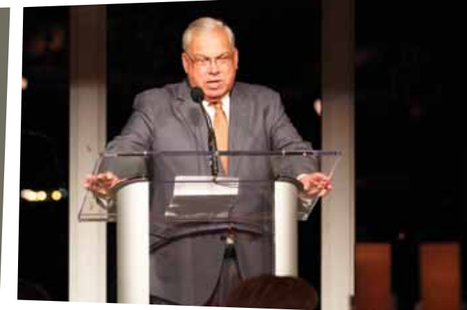
Honorary > Beach Ball Chair Mayor Thomas M. Menino